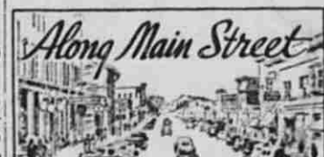
Work on the new Main-st. bridge goes merrily on or perhaps we should say: goes noisily on.

Aviation Training For H.S. Graduates The Ford Motor Company is offering to a limited number of high school graduates between the ages of 18 to 20 years, the opportunity to acquire training in ground mechanics in aviation.