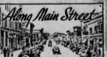
The wise wife does her Christmas hinting early.

Several Lowell F. F. A. boys received prizes at the Southwest Michigan potato show at Belding in the poster contest.