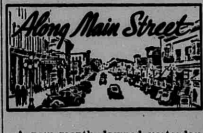
Along Main Street

A new month dawned yesterday, Thanksgiving Day is only three weeks away and Christmas will be here almost before we know it!