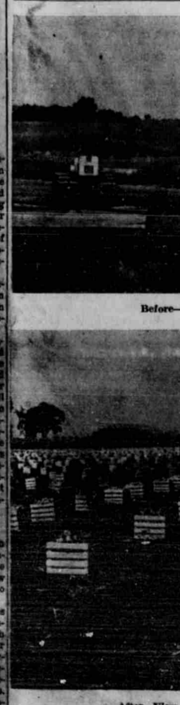
After-View Shows Virgin Acres Converted Into Fertile Fields