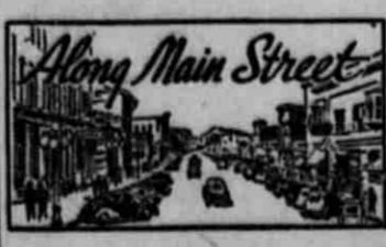
Along Main Street