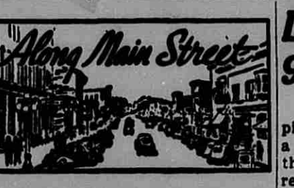
Along Main Street

When news went slow A WINNEPEG man has a copy of the London Times of Nov. 6, 1796, which prints a story based on the statement of George Washington that he was not a candidate for a third term as president of the United States.