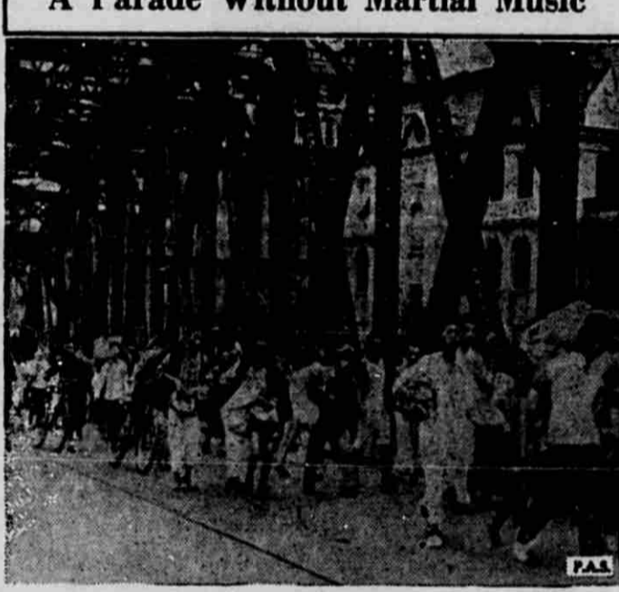
SHANGHAI, China . . . A part of the population of war-torn Shanghai leaving the city recently, when fighting became so heavy, that part of the city was destroyed.