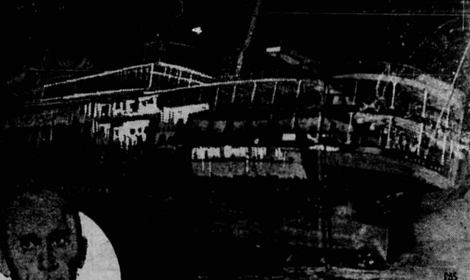
NEW YORK... The intense interest in the Federal investigation of the burning of the Marco Castle with great loss of life was reflected by the manner in which the site was viewed.