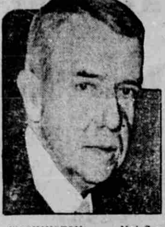
WASHINGTON . . . Maj. Gen. John Henry Russell, is the new head of Uncle Sam's Fighting Marines. This photo was taken at his desk in the Navy Department, when he took over the command last week.