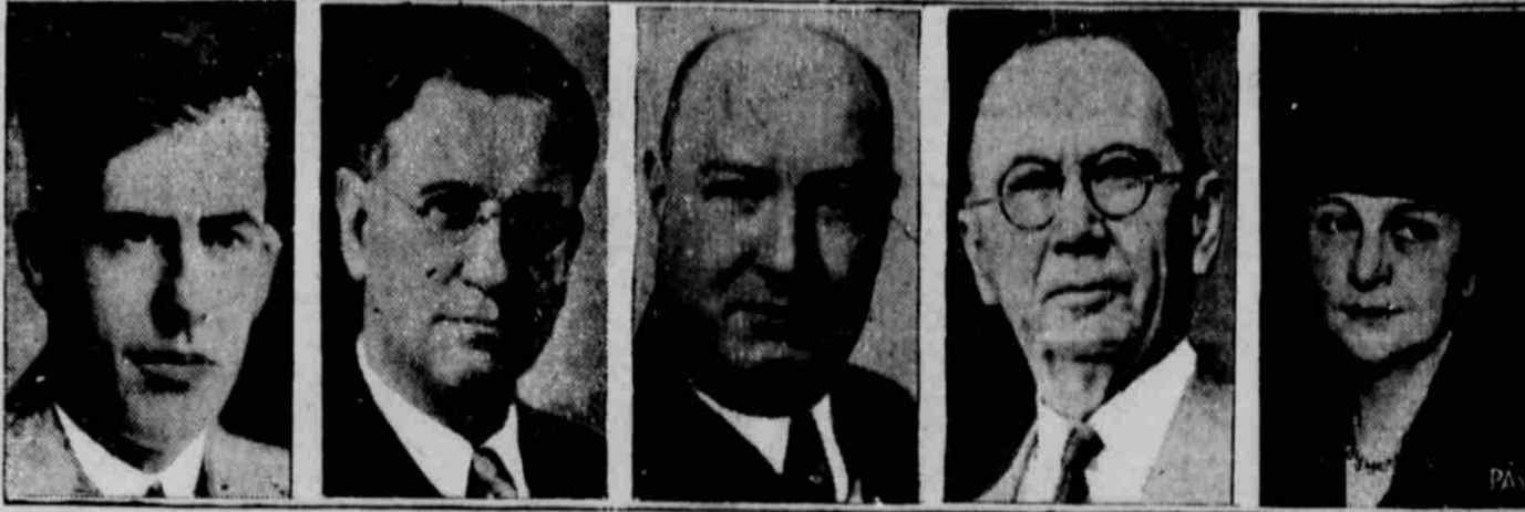
Henry A. Wallace Secretary of Agriculture; Harold Ickes Secretary of Interior; James A. Farley Postmaster General; Daniel C. Roper Secretary of Commerce; Miss Frances Perkins Secretary of Labor

Note—Since the above cut was made Senator Walsh has been taken by death. His post has been filled by Homer S. Cummings of Connecticut.