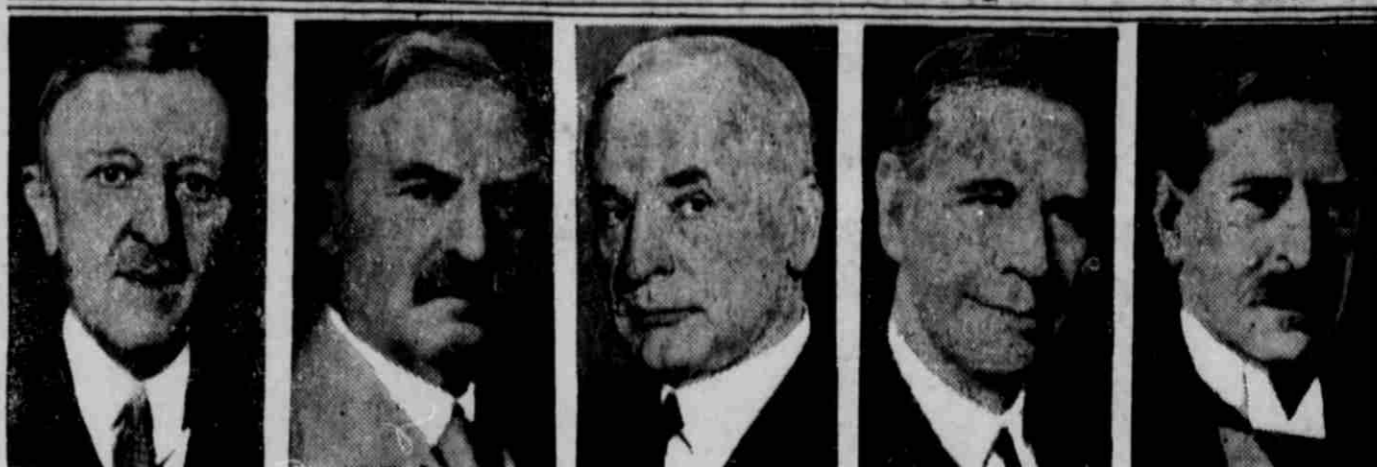
William H. Woodin Secretary of Treasury; Thomas J. Walsh Attorney General; Cordell Hull Secretary of State; George H. Dern Secretary of War; Claude A. Swanson Secretary of Navy