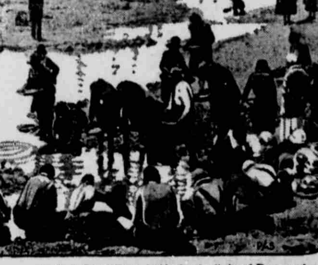
Score on the South Platte River, inside the city limits of Denver, where expert placer miners teach the unemployed how to work gold out of the gravel of the river bed. They can get from $1 to $2 a day and sometimes there's a lucky strike.