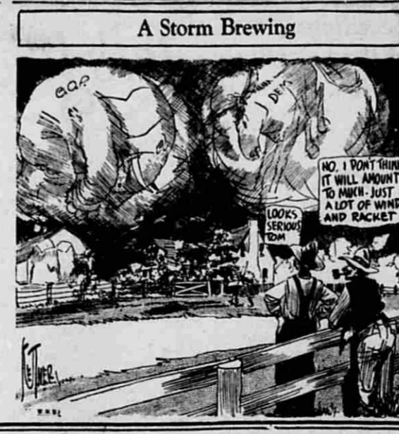
A Storm Brewing