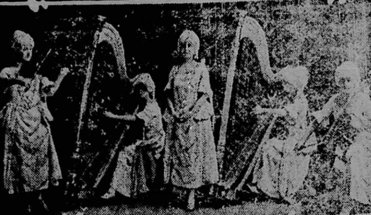
THE COLONIAL QUINSET brings new atmosphere of a romantic bygone age to the Lyceum course.