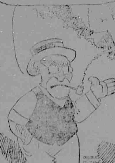
Founded by English King

LISTEN HERE, OYM FELLERS! DON'T LAFF AT THIS HERE TOWN BECUZ IT'S SMALL AN' HAIN'T GOT ALL TH' THINGS NEW MOOKS HAS, BECUZ THEM MOST O' THEM THINGS WE DON'T WANT, SECH AS MURDERS, THEFTS, DIVORCES, FEVERS, BLUMS, CONFESSION, CRIME AN' TH' GOLD HEARTEDNESS THAT LEYS FOLKS STARVE IN TH' MOST O' PLENTY HOSRS!