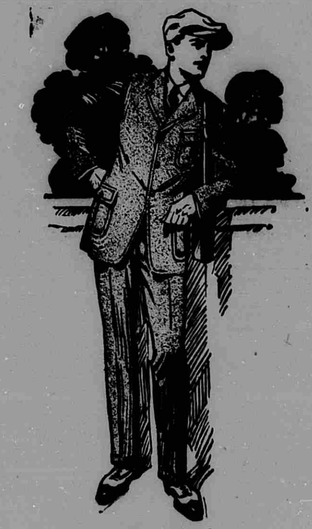
Copyright 1924 Hart Schaffner & Marx

Brezina's Feed, Produce and Poultry House Hay, Straw, all kinds of Stock and Poultry Feeds, Chamberlain's Full O'Pop Chick Starter, Poultry Tone, Call Meal, Stock Salt, Apples, Onions, Potatoes, Peas, Corn.