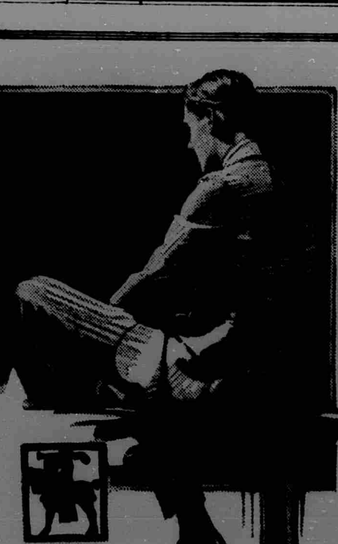
Copyright 1921 The Schaffner & Marx