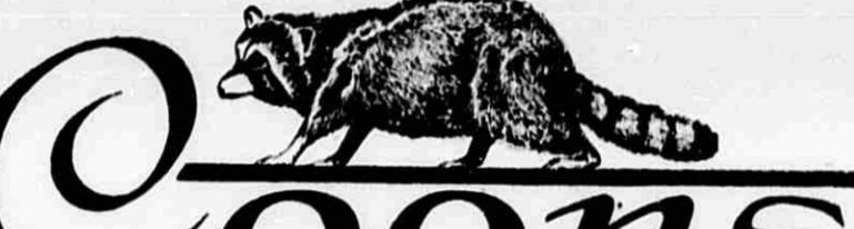
The home of Hart Schaffner & Marx clothes

We're helping men and boys to save on clothes every day. We can help you save. It's the values that do it. Buy your clothes here and "bank the savings."