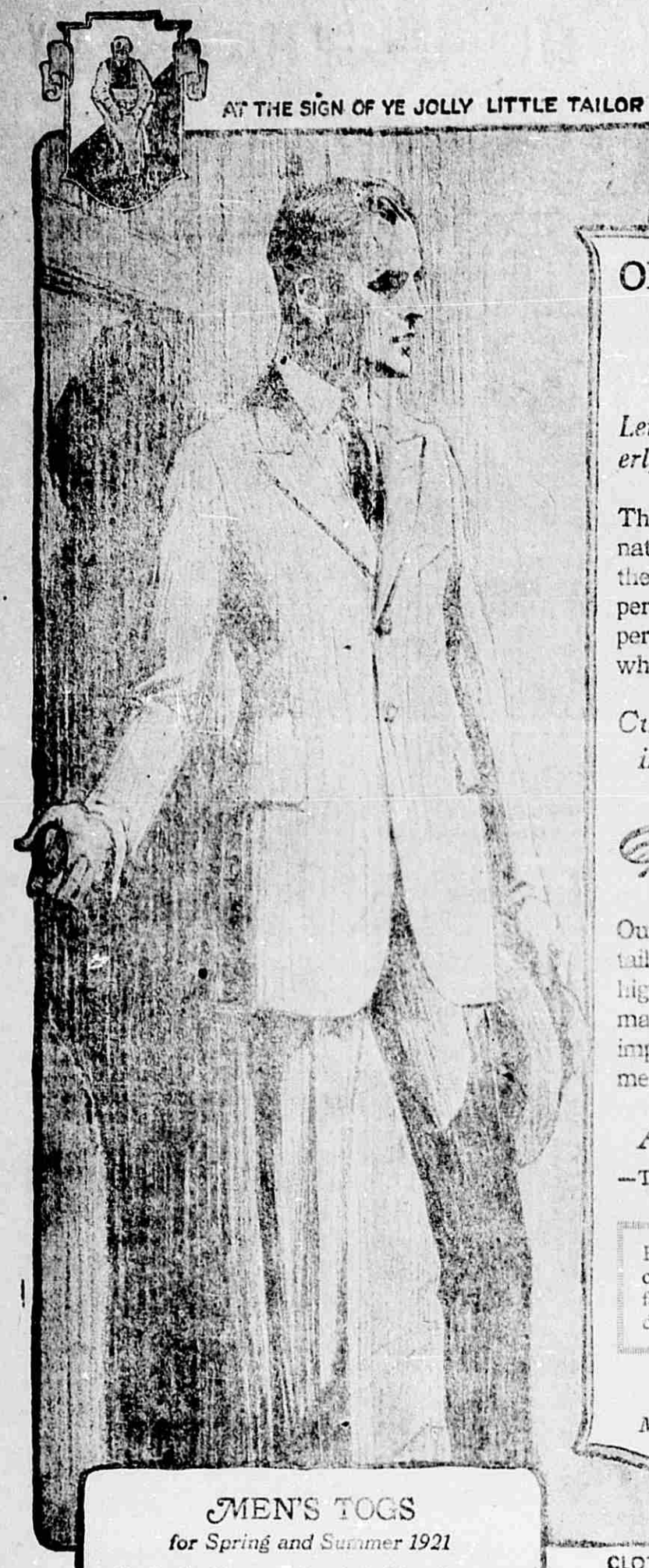
AT THE SIGN OF YE JOLLY LITTLE TAILOR