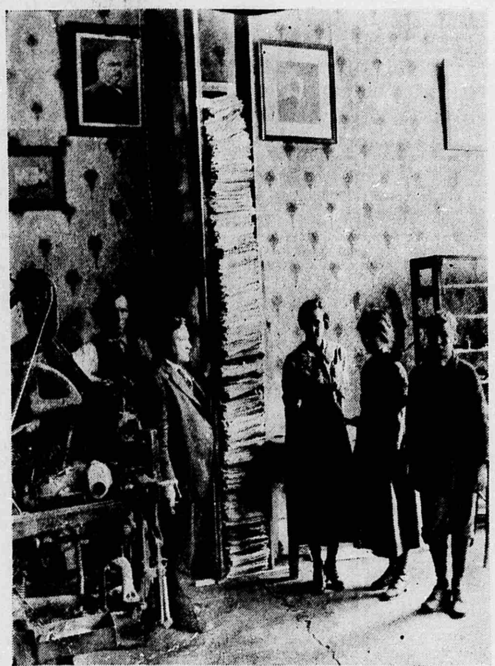
Photograph of extra edition of The Lowell Ledger of January 29, taken at the office by Photographer Hill. From spoilage and shortage the 9-foot stack of papers shown is about fifty copies short of our present regular edition. We have long wished to show such a picture; but have been unable to do so before as the regular editions are taken to the post office as soon as ready for mailing. The sale of an entire extra edition gave us the chance desired. Advertisers interested in knowing what they get for their money should multiply the number of papers in the pile by five, the size of an average family, to ascertain just how many readers we and they have.