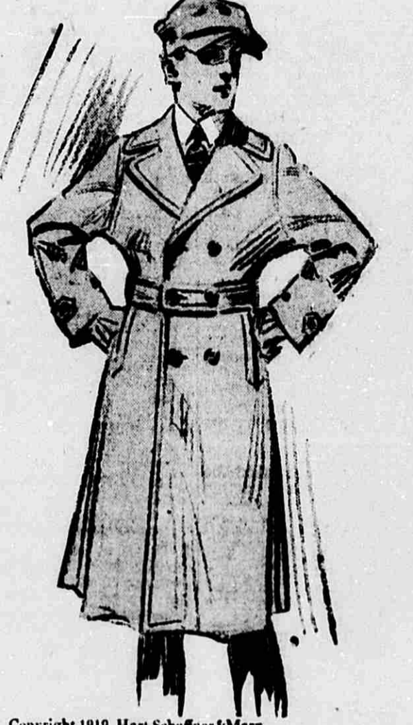
Copyright 1919, Hart Schaffner & Marx

All thru the season we've sold these coats on narrow margins.