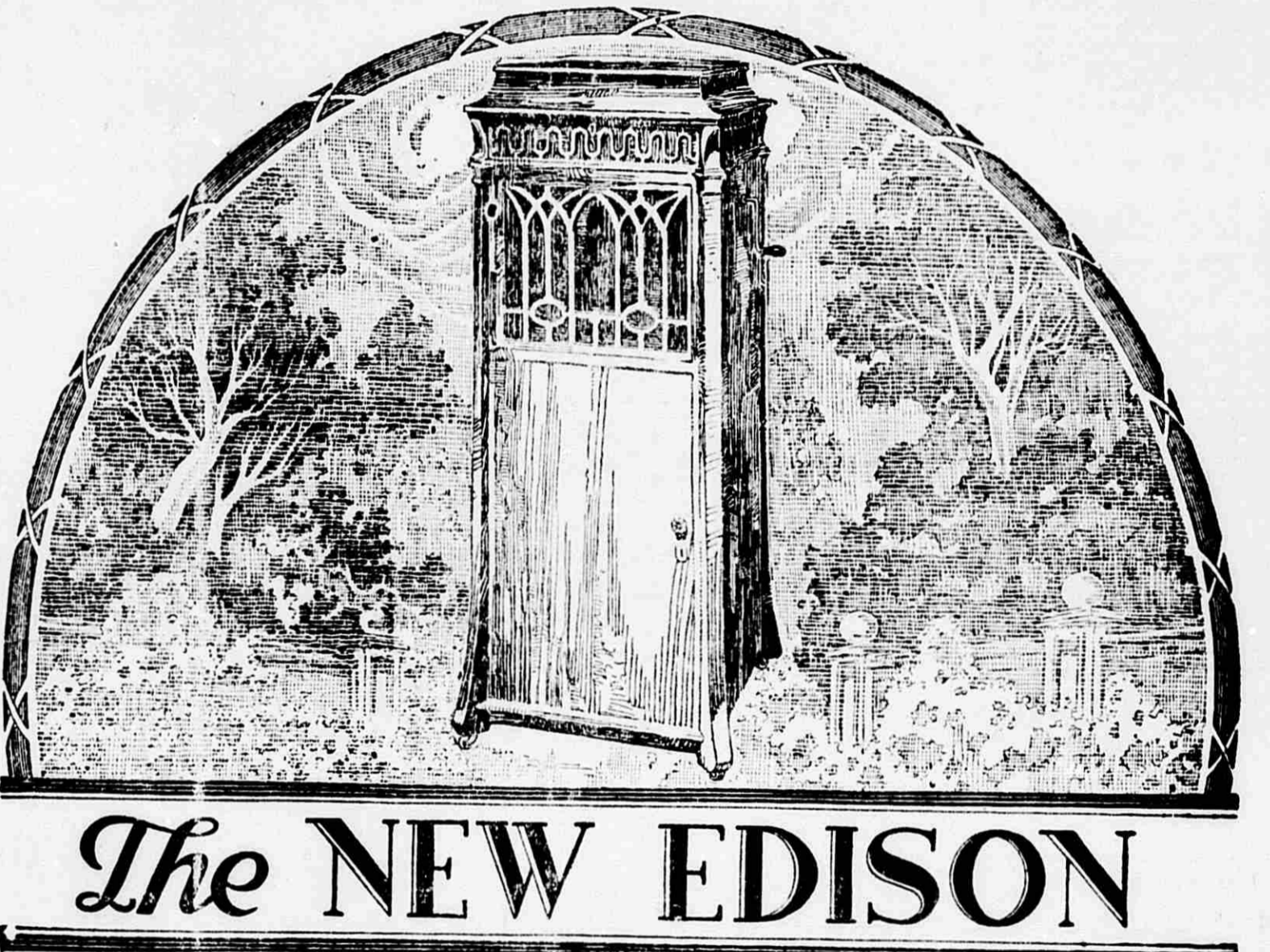
The NEW EDISON... No Need to Change—Check is Held at All Other Music Stores Where Played on The New Edison