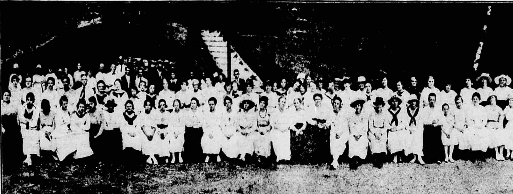
SECOND ANNUAL PICNIC OF THE EMPLOYEES OF THE MICHIGAN MOTOR GARMENT COMPANY Greenville, July 28—We are sending you under separate cover picture taken at our second annual picnic. Excepting the little girl in the front row, all are employees of this company, and you will notice they are a mighty healthy looking bunch. Of course, all did not take advantage of our picnic, but we have a very good representation. This picnic was held at Baldwin Lake which you are well acquainted with. Some of the families of the employees were also present, making a total of 145 present. The company furnished transportation, swims, boats, dance pavilion and orchestra, as well as part of the feed. The picnic this year was about twice as large as last year and we hope that next year we will be able to double the attendance. Twenty-five employees of the Lowell factory are in the picture, which was first printed in The Michigan Tradesman.