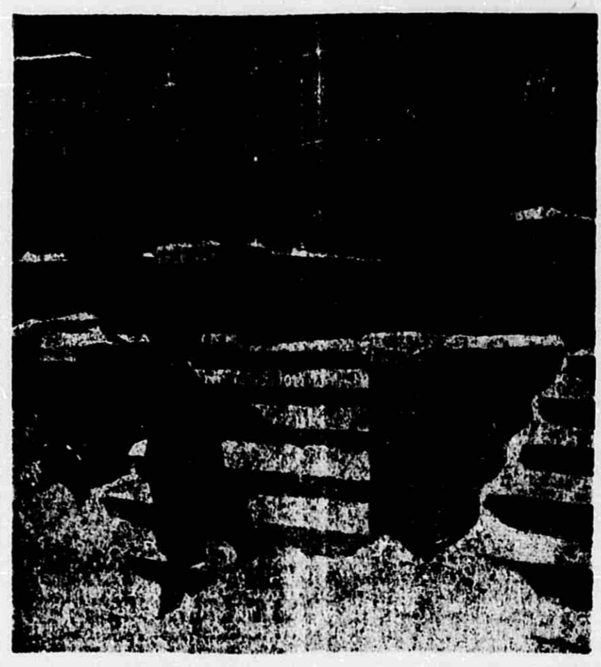
"BOY WANTED—TO EARN THRIFT STAMPS"