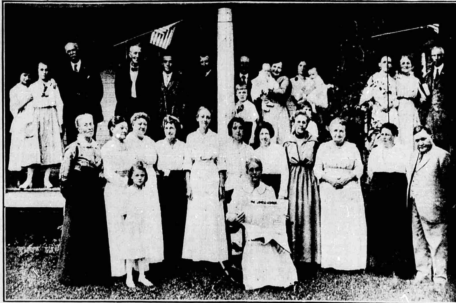
On the Lawn at Seven Oaks, June 30, 1917.