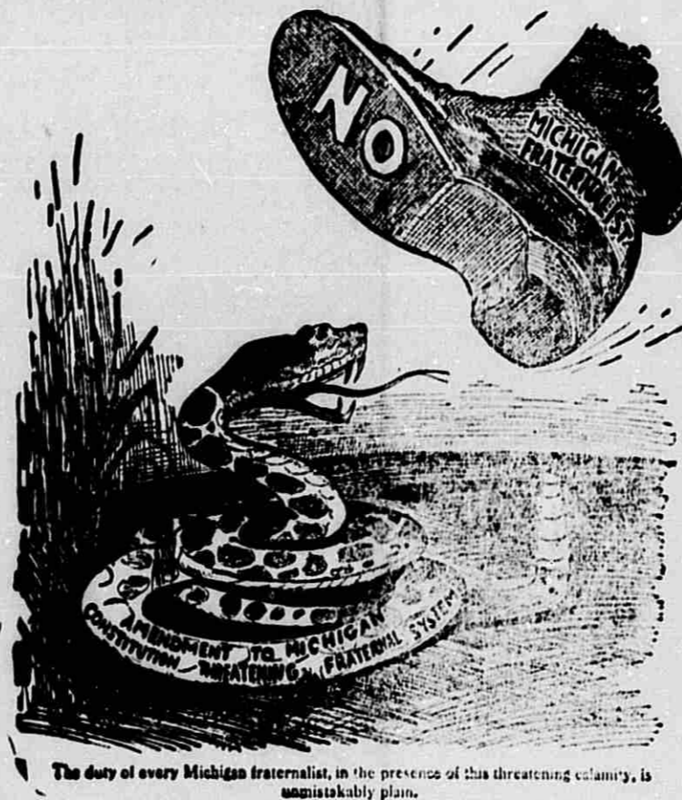
The duty of every Michigan fraternalist, in the presence of this direst enemy, is unmistakably plain.

Destroy the Viper with your Emphatic "No."