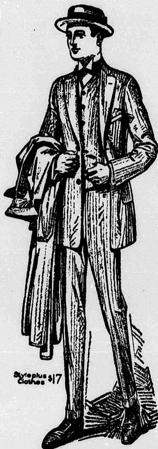
Styleplus $17 Clothes

All the new patterns. Every variety of style that is correct . You pick out the suit that best becomes you, knowing the price is only $17 and that the quality is guaranteed.