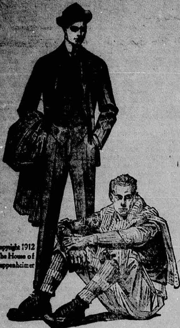
Copyright 1912 The House of Kuppenheimer