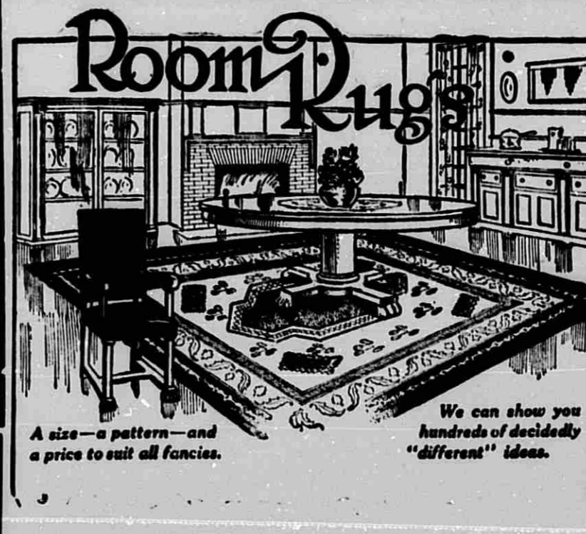
A size—a pattern—and a price to suit all fancies.

At the City Hall Friday Eve. Ap. 21 Yourself and lady are invited to attend. Five Piece Orchestra. Bill 75c.