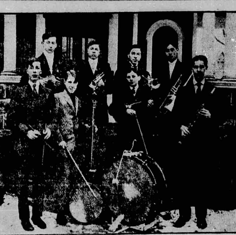
The Lowell High School Orchestra.