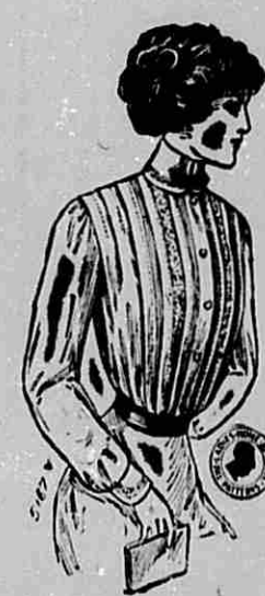
The Ladies' Home Journal Pattern No. 5167

Several dozen handsome waists at 98c. Many of the New Fall Styles are included in the assortment. Both Lingerie and tailored models.