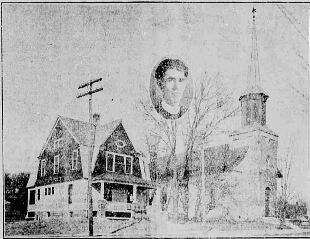
METHODIST PARSONAGE, PASTOR AND CHURCH.

There will be a public meeting of all interested in the project at Hotel Waverly Saturday, March 3, at 2 p. m. Turn out.