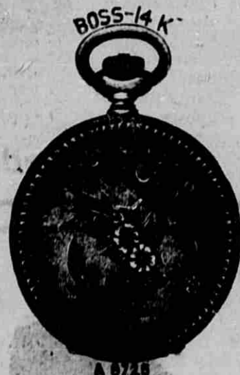
BOSS-K-K A 6725

Since we moved into our new quarters in the new Negonce block we have added thousands of dollars worth of artistic, up-to-the-minute things to our already large stock of Watches, Clocks, Jewelry, Silverware, Cut Glass and Fancy China, and we are sure if you will come in and look over the assortment you can find everything the heart might wish for and prices will make a lean pocketbook smile with joy at the prospects before it.