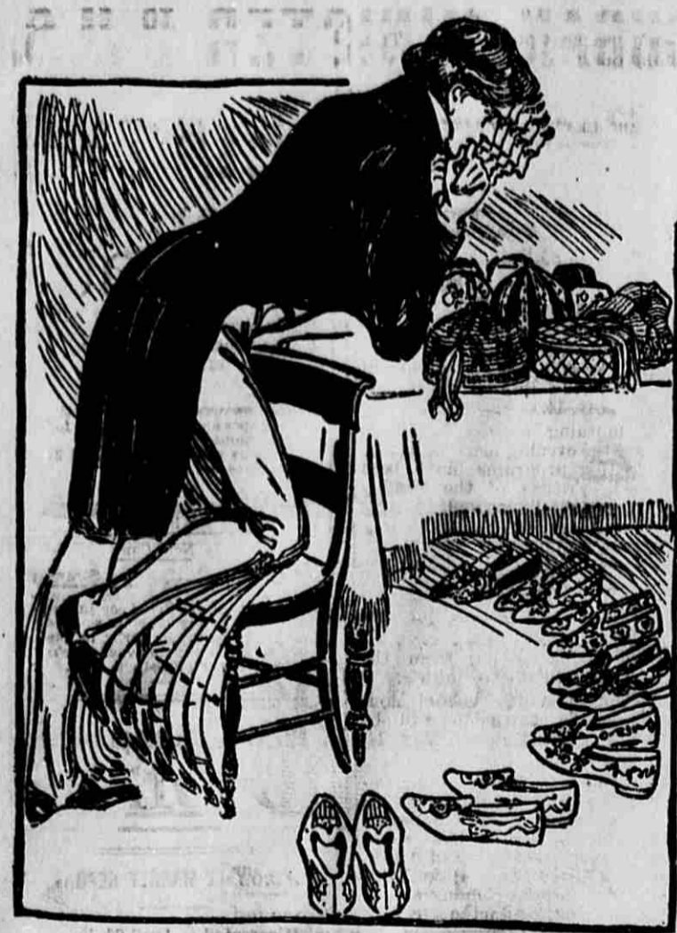
The Only Way He Could Wear Them All.

The shops, among their most desirable youth in every respect, he was quite delighted to announce openings in the department of needlework fancy articles and yarns.