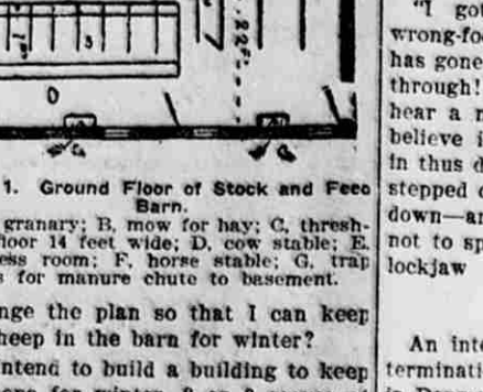
Fig. 1. Ground Floor of Stock and Feed A. granary, B. room for hay, C. trough for water, D. cow stalls, E. horse stalls, F. room for manure, G. room for grain. I intend to build a building to keep 20 head of winter, 2 or 3 seasons of chickens in spring, and 4 pigs and a room for breeding sow and a room for 8 or 10 cows of wood. All I would like to have a room in which to sell feed.

Designed to Accommodate Animals of All Kinds. J. McP.—Please publish two plans, one for a poultry house, and wood shed and the other for a horse and feed. I should like to have 10 or 12 tons of grain, 8 cows and 2 horses on the ground floor. I want to have about 12 young cattle down in the cellar, and manure in the cellar, too. I intend to build it on a hill, with driveway door on north side, and manure on the south. I can look to have a room for grain. Can you