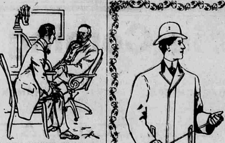
"I HAVE THOUGHT OF IT," SAID MR. MORTON.

"I do not concede that," interrupted Mr. Morton. "That, however, has nothing to do with your proposition. I am willing to listen to it."