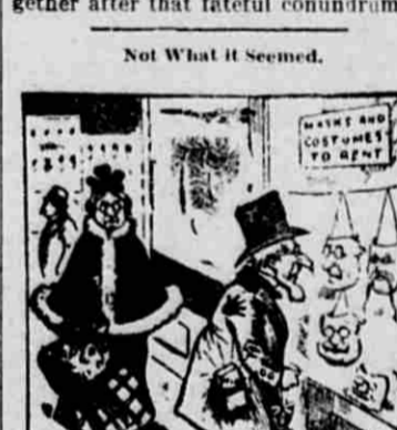
Not What It Seemed.