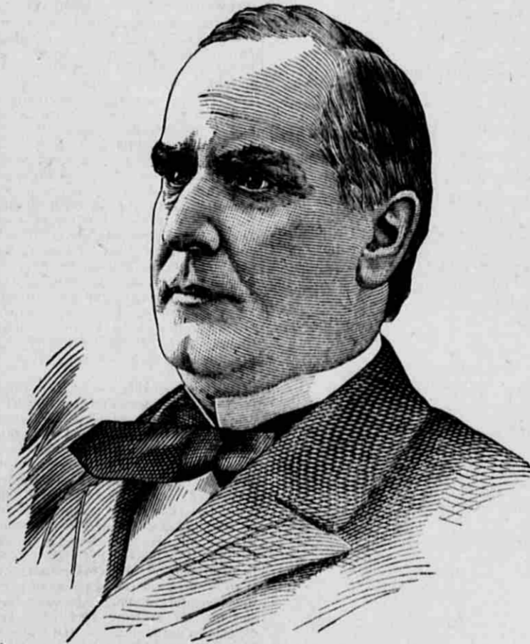
WILLIAM McKINLEY Re-Elected President of the United States