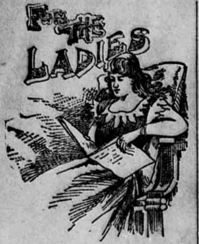
The Way We Walked. I met a woman on life's way...