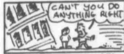
The Leaning Tower of Pisa has been leaning since the day it was built.