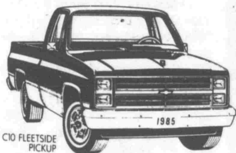
C10 FLEETSIDE PICKUP