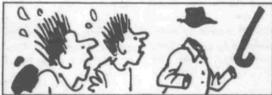
People once believed that wearing or eating fern seed would make them invisible.

The Michigan Credit Union League, headquartered in Southfield, is the state trade association representing more than 650 credit unions.