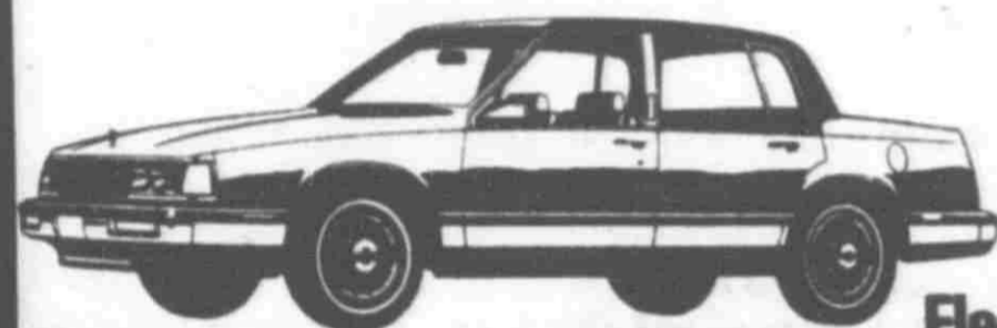
1985 Buick Park Avenue Sedan