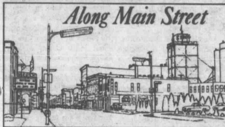
Along Main Street