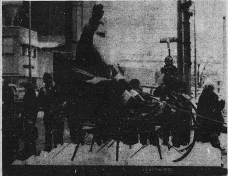
In this Ledger file photo Santa arrived via an antique sleigh, in years past he has come to Lowell on flats, fire trucks and even a wrecker. This year he will be riding a brand new float built especially for him.

Following the parade Santa will be available for pictures with your children at Lambert's Variety until 5:00 P.M. The photos are professional 5 x 7 color portraits in a folder at the