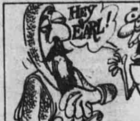
Earl is the oldest title of nobility in the British peerage, and third in rank behind duke and marquis.