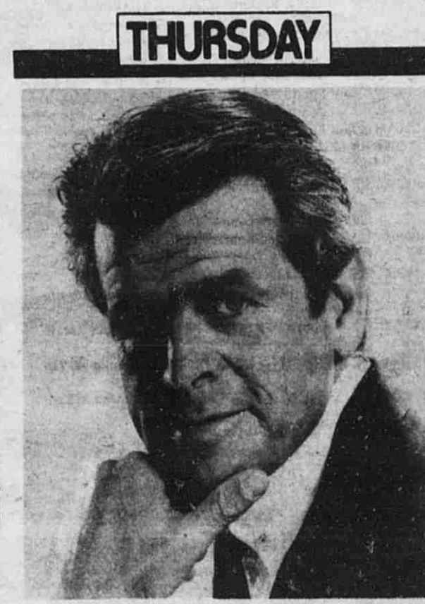
William Devane stars as state Senator Gregory Sumner on "Knots Landing," to air on CBS, Thursday, Dec. 8.

"Baseball is the greatest conversation ever invented in America." -Bruce Catton