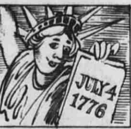
The tablet held in the hand of the Statue of Liberty contains a lone inscription: July 4, 1776.