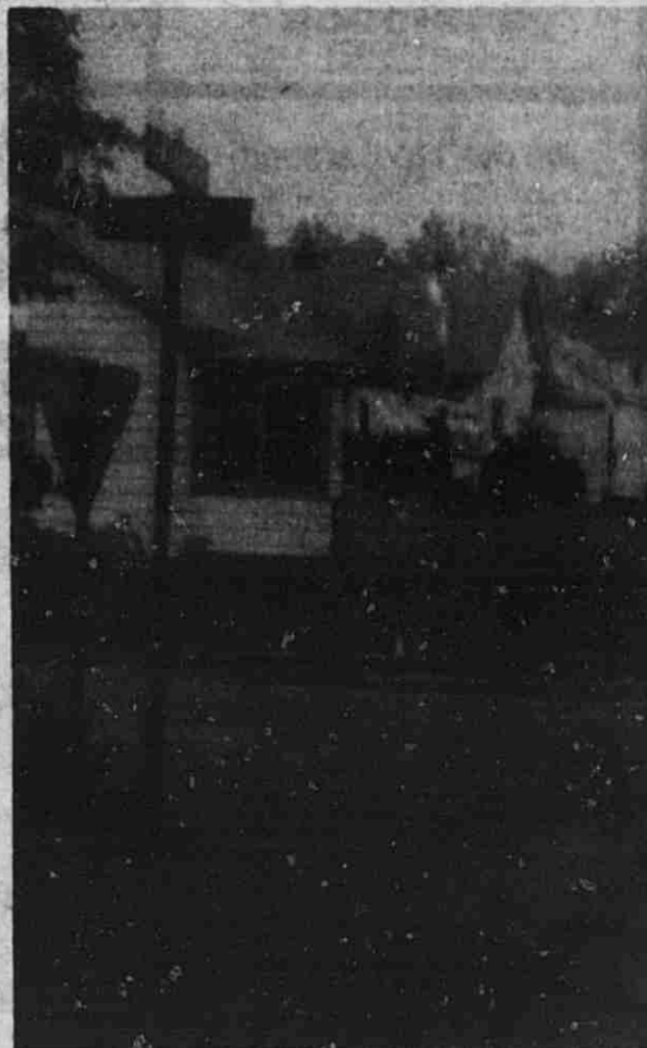
This house at the southeast corner of Lafayette and Pine Streets is located about fifteen feet into the Pine Street right of way.

PHOTOGRAPHY CLASS - Basic 35mm photography, Thursday nights starting Sept. 29. Call Modern Photographics 897-5606.