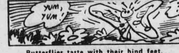
Butterflies taste with their hind feet.