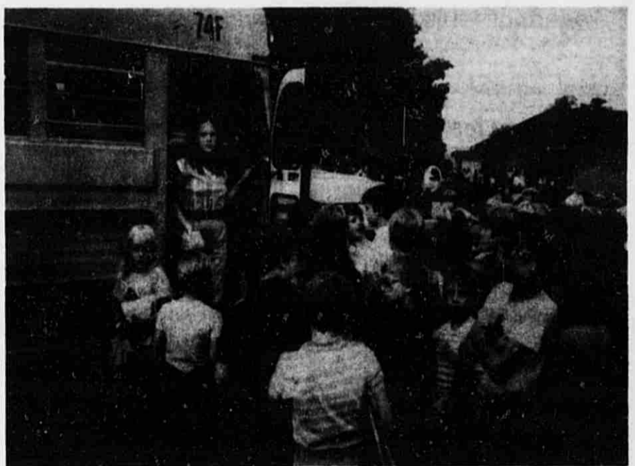
It seems like just yesterday that the kids were boarding the school buses to go home for the summer. These students are waiting to board a shuttle bus at Bushnell Elementary School on the first day of school.

Michigan youngsters can continue to get high marks in traffic safety by crossing streets properly and keeping out of school bus danger zones, according to the Automobile Club of Michigan.