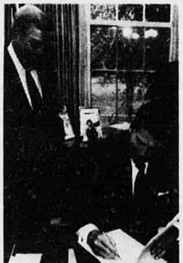
James B. Edwards and President Reagan

America's energy problems aren't over yet, but former Energy Secretary James B. Edwards says solutions are coming into focus that promise great hope for the future. 'The energy crisis is not over, but we can put the siege mentality that it spawned behind us,' says Edwards.