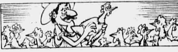
More chickens are raised in California than any other state.

TUESDAY 8/30/83 5:00AM [MAX] - 'The Wooden Horse' 6:00AM [HBO] - 'A Challenge For Robin Hood' 6:30AM [MAX] - 'Freedom Road' 7:00AM [HBO] - 'The Cowboy and the Lady' 8:00AM [HBO] - 'Smokey and the Bandit' 8:30AM [HBO] - 'The Fighter' 9:00AM [HBO] - 'Member of the Wedding' 10:00AM [HBO] - 'Barbarosa' 11:30AM [HBO] - 'Looker' 12:00PM [MAX] - 'The Godfather: Part 2' 12:30PM [MAX] - 'The Godfather: Part 2' 1:00PM [MAX] - 'The Godfather: Part 2' 1:30PM [MAX] - 'The Godfather: Part 2' 2:00PM [MAX] - 'The Godfather: Part 2' 2:30PM [MAX] - 'The Godfather: Part 2' 3:00PM [MAX] - 'The Godfather: Part 2' 3:30PM [MAX] - 'The Godfather: Part 2' 4:00PM [MAX] - 'The Godfather: Part 2' 4:30PM [MAX] - 'The Godfather: Part 2' 5:00PM [MAX] - 'The Godfather: Part 2' 5:30PM [MAX] - 'The Godfather: Part 2' 6:00PM [MAX] - 'The Godfather: Part 2' 6:30PM [MAX] - 'The Godfather: Part 2' 7:00PM [MAX] - 'The Godfather: Part 2' 7:30PM [MAX] - 'The Godfather: Part 2' 8:00PM [MAX] - 'The Godfather: Part 2' 8:30PM [MAX] - 'The Godfather: Part 2' 9:00PM [MAX] - 'The Godfather: Part 2' 9:30PM [MAX] - 'The Godfather: Part 2' 10:00PM [MAX] - 'The Godfather: Part 2' 10:30PM [MAX] - 'The Godfather: Part 2' 11:00PM [MAX] - 'The Godfather: Part 2' 11:30PM [MAX] - 'The Godfather: Part 2' 12:00AM [MAX] - 'The Godfather: Part 2'