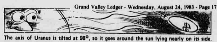
The axis of Uranus is tilted at 98°, so it goes around the sun lying nearly on its side.