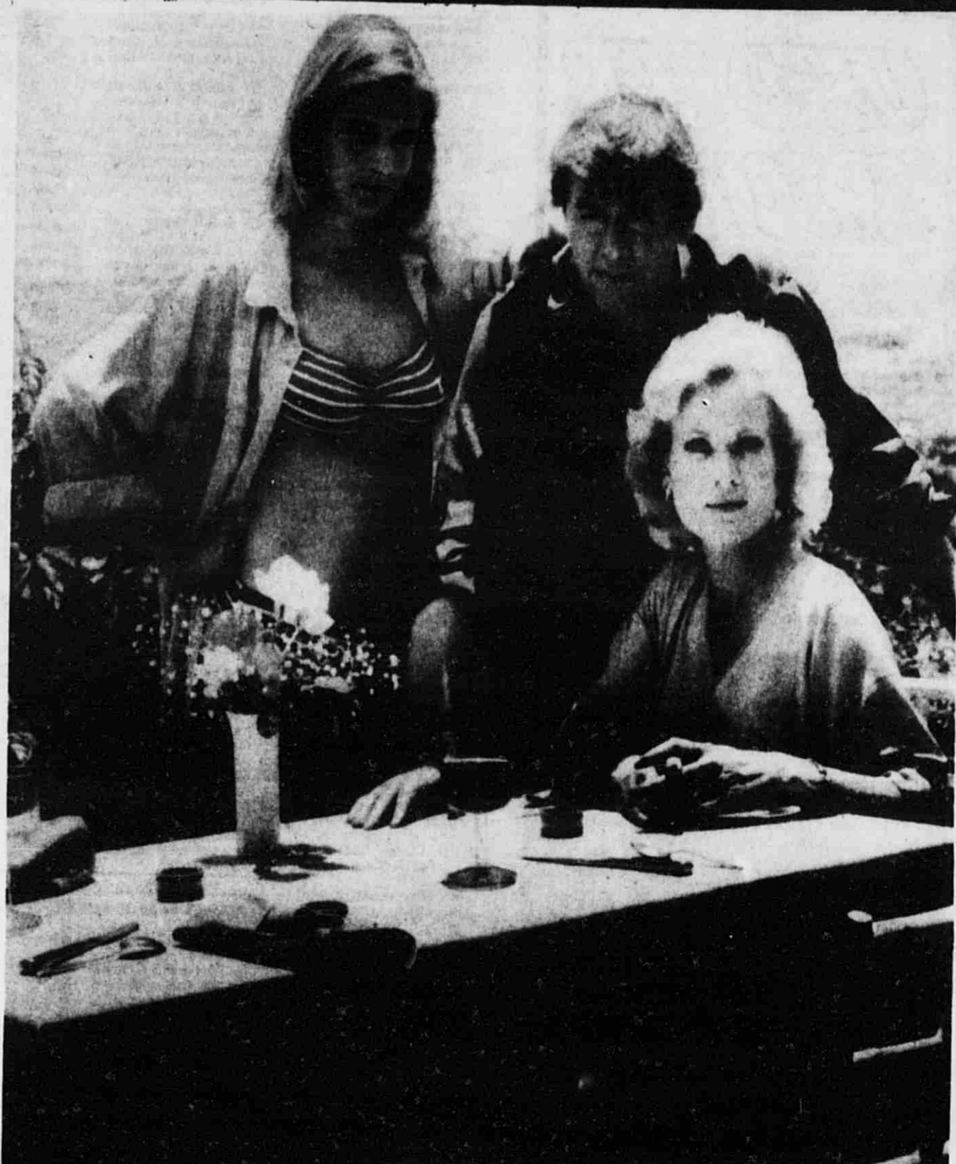
CONTAINS LISTINGS FOR FRIDAY, JULY 29 THRU THURSDAY, AUGUST 4, 1983