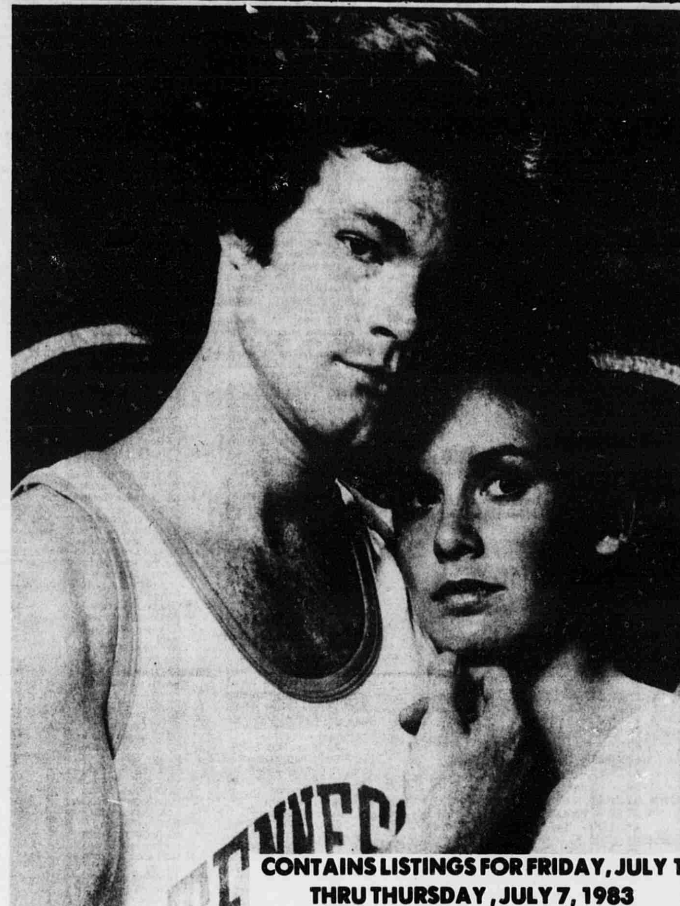
CONTAINS LISTINGS FOR FRIDAY, JULY 1 THRU THURSDAY, JULY 7, 1983

David Keith and Stephanie Zimbalist portray star-crossed lovers in the four-hour production of "The Golden Moment: An Olympic Love Story." Part one airs Sunday, July 3 on NBC. The concluding half airs Monday, July 4.