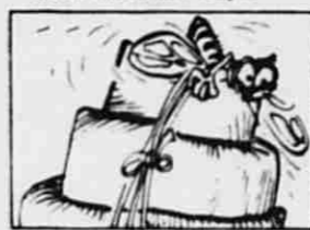
A honeybee can carry a burden 300 times its own weight.

V.F.W. Post 8303 307 East Main St., Lowell