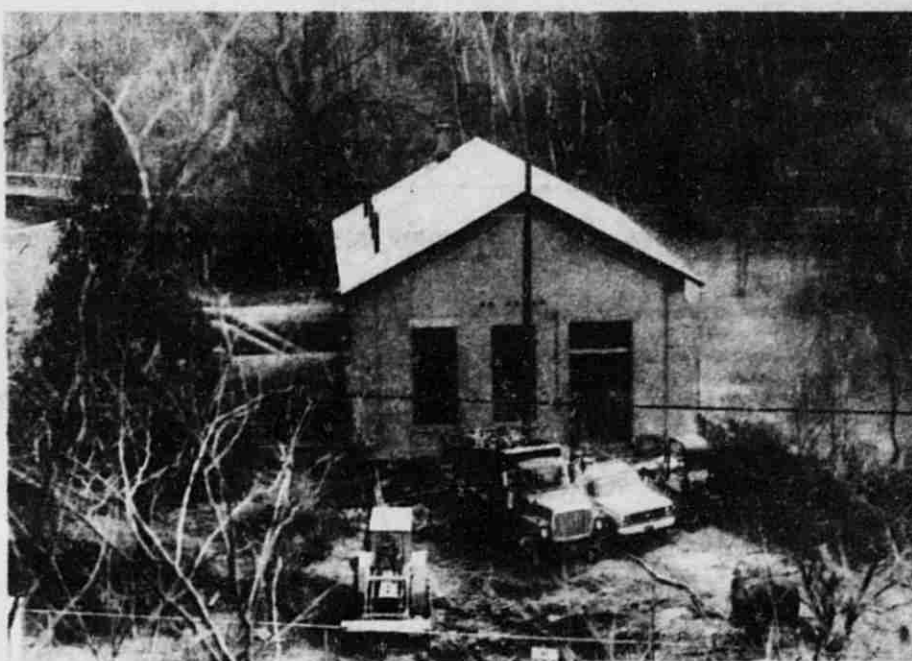
Repair work on the Fallasburg powerhouse has already begun. STS Consultants, Ltd., is expected to shell out $750,000 for purchase and repair of the structure.

Appointments not always needed at Vanity Hair Fash- ions, Open five days Lowell, 897-7506.