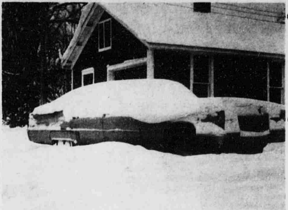
Apparently some vehicle owners decided that it was simpler to wait for spring to melt the snow off their cars than to brave the weather and muscle the unwelcome white stuff away.

897-9596 M - 12:30 - 5:30 W - 12:30 - 8:30 F - 12:30 - 5:30 S - 12:30 - 5:30