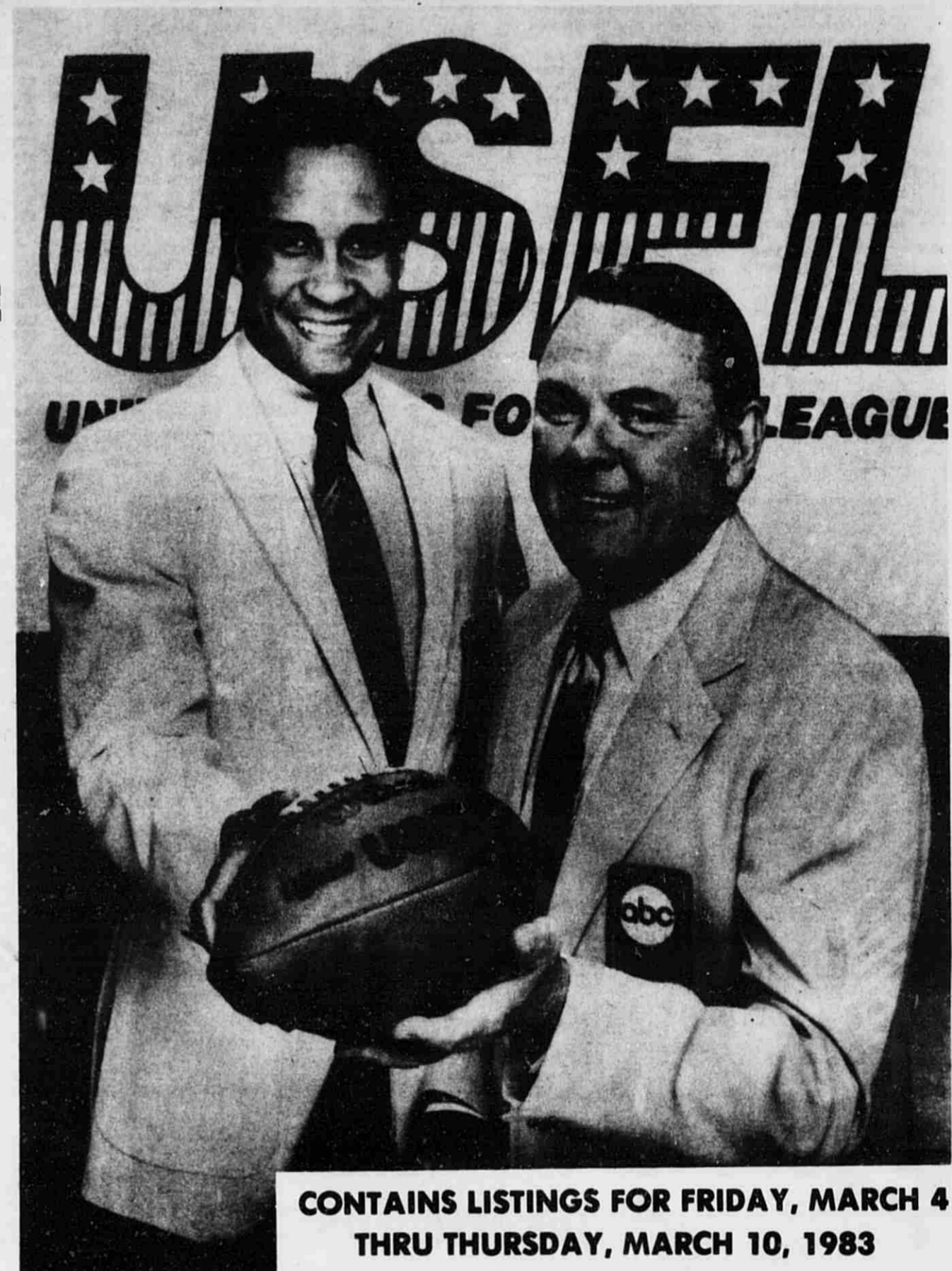
CONTAINS LISTINGS FOR FRIDAY, MARCH 4 THRU THURSDAY, MARCH 10, 1983

Former Pittsburgh Steeler Lynn Swann (l.) teams with veteran ABC commentator Keith Jackson for the kick off of the United States Football League's first season. The duo will be in the booth for the Sunday, March 6 broadcast.