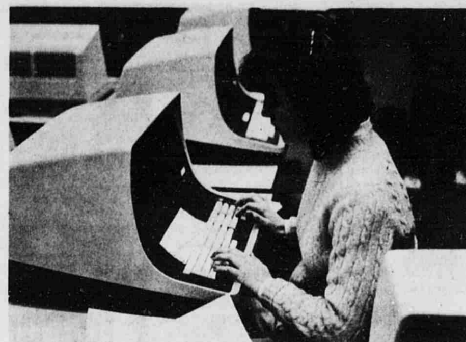
Students at the Kent Skills Centers, such as the young woman pictured operating a data processor, learn entry-level job skills which put them in good stead in the work force.

Napp also said that although enrollment in Kent Intermediate School District is down, enrollment at the Centers is up 5 percent over last year. Every