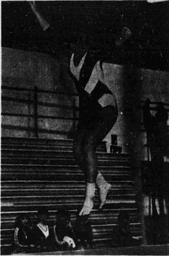
A Lowell gymnast shows her form at the Ionia-Lowell matchup held Monday, February 28. The Arrows finished the meet at the top of the heap.