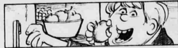
Apples, grapes, cranberries, plums and cherries should be stored in the refrigerator immediately after purchase and are best eaten within a week.

SCRATCH PADS - Glorious white paper bound with red gummy stuff. Various sizes. (None as large as a breadbox.) 75c a pound. Ledger, 105 N. Broadway.