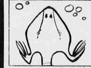
The Galapagos batfish walks around the bottom of the sea on two stiff pectoral fins.

JULY 12, 13 and 15 The Ionia County Chapter of the American Red Cross will hold a basic life support course in CPR from 6:30 till 9:30 P.M. at the Saranac High School. $5.00 charge to cover cost of materials. To Register call 897-9679.