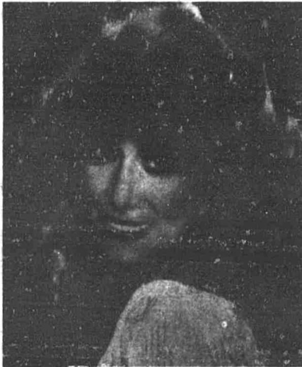
Dottie West will bring her dazzling smile and country sounds to the Showboat stage this summer as star of the annual family entertainment extravaganza on Monday through Wednesday nights, July 20-22.